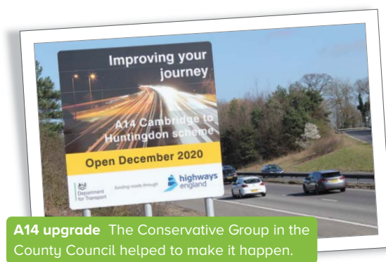
A14 upgrade The Conservative Group in the County Council helped to make it happen.